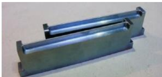
Fig. 3 Segments with TiCN/PVD coating

surface of PVD-TiCN treated stamping insert after 1.8 \times 10^6 strokes was observed without damage, the surface was smooth and compact, wear particles were not present on the surface - Fig. (b) [8-11]. The experiments show that the roughness of stamped parts obtained by coated and uncoated dies have been unaltered.