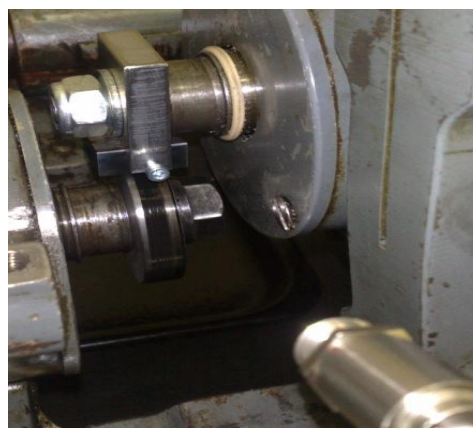
Fig. 2 Friction pair

sliding speed 100 mm/s, temperature 22 °C, boundary friction). The principle and detailed view on the test is shown in Fig. 2. The friction pair consists of flat sample made of VANADIS 6 (coated by PVD/TiCN) in tribocontact with counterpart discs (Disc-on-Plate test) made of steel 14 220 (1.7131 (16MnCr5), heat hardened, tempered and carburized to 62HRC - 800HV) with 50 mm in diameter and 10 mm width. The hardened steel disc was used as counterpart to initiate wear of the investigated materials and coatings. Analysis of worn surfaces was performed by light microscopy and SEM.